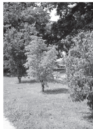
Kousa dogwood adversely affected by insufficient moisture.

Drought can be caused by less than normal rainfall. It can also be caused by hot