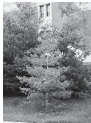
Eastern white pines that are growing well at the top of the man-made berm where drainage is good, but declining at the bottom of the berm due to excess drainage water.

Run off from pavement, roofs and other impervious structures can flood a site with excess water. Cleared and graded slopes, where natural vegetation would normally absorb excess water, may shed runoff down slope. Soil compacted by heavy machinery or even heavy foot traffic can have drainage problems because water may be unable to drain through the soil.