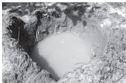
Determine soil drainage with the "hole test."

To roughly gauge the rate of drainage for a particular soil, try the "hole test." Dig a hole