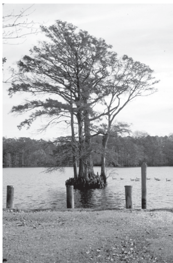
Bald cypress is a species very tolerant of wet sites.

Many trees have adapted to growing in wet sites. For example, when growing in or around water, bald cypress produces protruding knobs ("knees") that extend above water or the saturated soil. These knobs are thought to help with air absorption into the roots. Willows and ashes, when stimulated by flooding, produce new air-filled roots to replace roots killed by excess moisture.